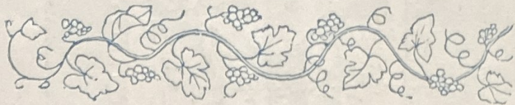
Broiderie for an Infant's Shirt.