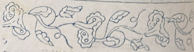
Inserting for a Child's Dress.