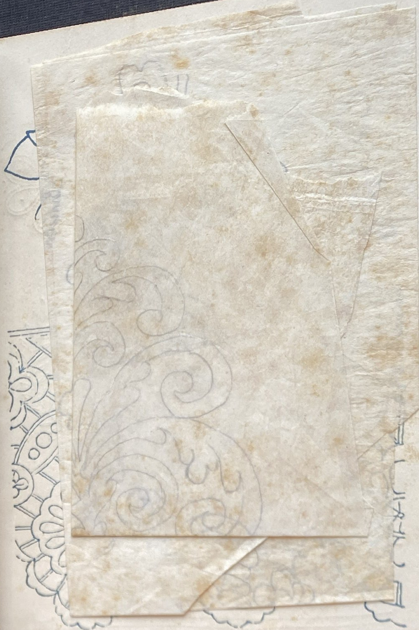
Eugenie Flouncing for Sleeves.