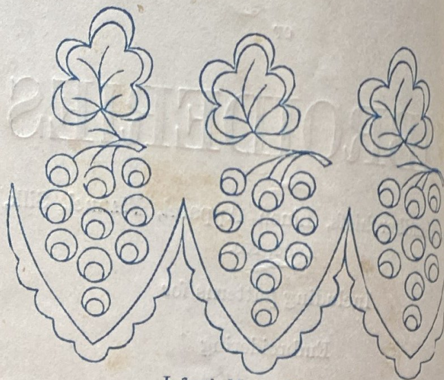
Infant's Mantle Embroidery.