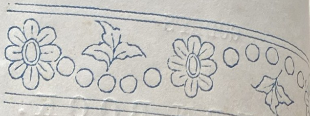
Inserting for a Boy's Shirt.