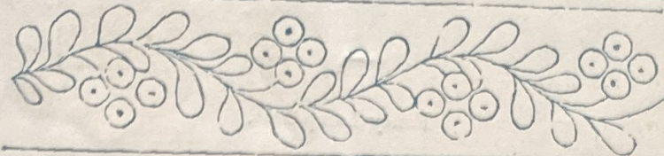
For an Infant's Dress.